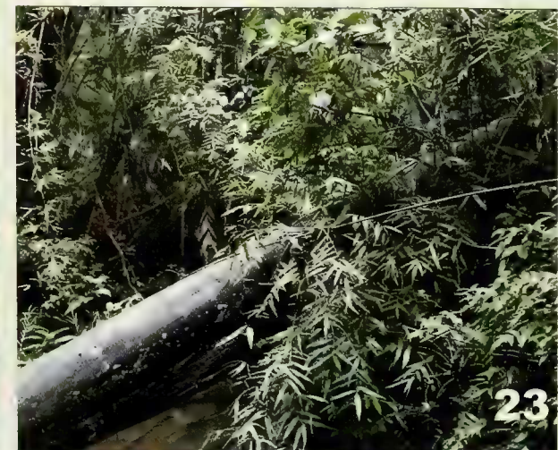
FIGS. 19-23. Type locality of Eretris agata , new species. 19. Chusquea ? sp. bamboo in a forest clearing. 20. Bamboo node detail. 21. Chusquea ? sp. bamboo, likely host plant of E. agata . 22. Young Miconia sp. (Melastomataceae). 23. Swampy forest with bamboo clumps